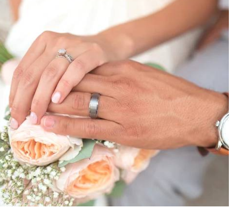
FOREVER CIVIL CEREMONY

When it's the one day you've always looked forward to and you're all about making it extra special. With all the necessities for a legal civil ceremony with some added extras so you can feel pampered and loved on your special day!